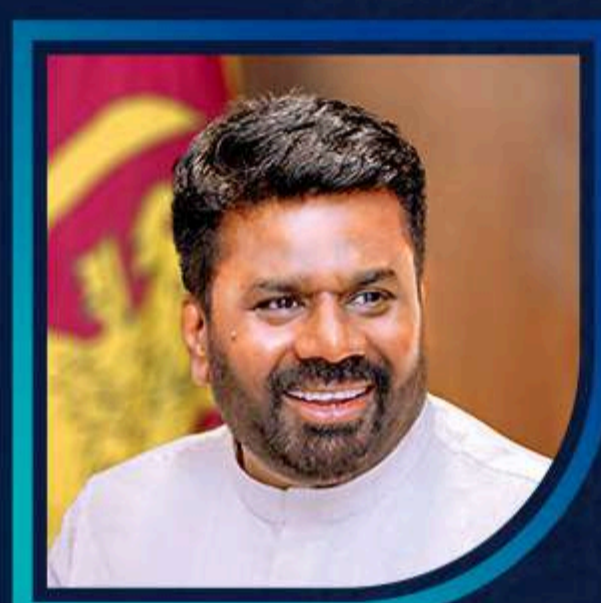
H E ANURA KUMARA DISSANAYAKE President of the Democratic Socialist Republic of Sri Lanka (Key Note Address)