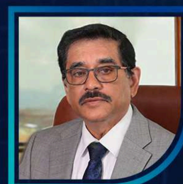
DR. P NANDALAL WEERASINGHE Governor - Central Bank of Sri Lanka (Economic Outlook)