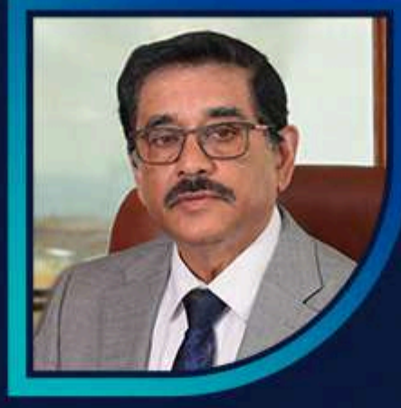
DR. P NANDALAL WEERASINGHE Governor - Central Bank of Sri Lanka

POLICY FRAMEWORK FOR ACCELERATED ECONOMIC GROWTH